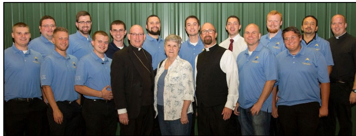
Pray for our seminarians! Pray for vocations!

October is Respect Life Month! As we celebrate the Feast of St. Luke, Patron of Physicians (Oct. 18), we ask all Catholic physicians and others who work in health care, to uphold the sanctity of life and the dignity of the human person. Let each of us do our part in building a Culture of Life.