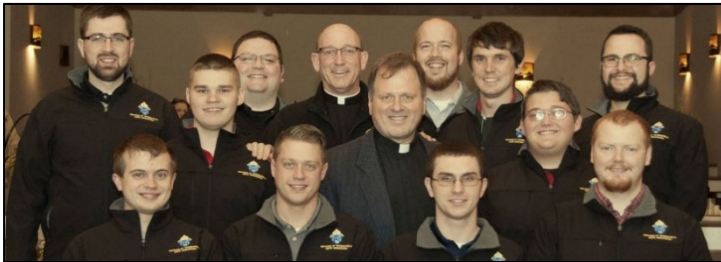
Pray for our seminarians! Pray for vocations!

July 2017: May Our Lady of Mount Carmel, whose feast we celebrate July 16, always protect us, guide us, and bring us closer to her son.