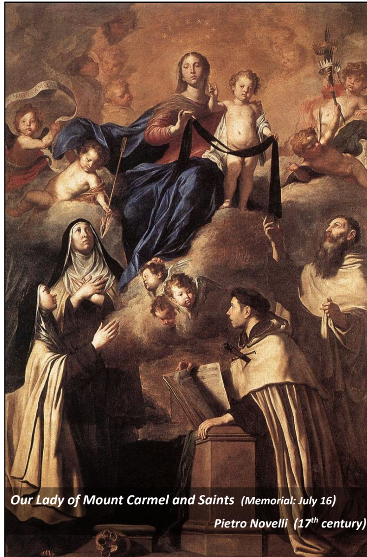
Our Lady of Mount Carmel and Saints (Memorial: July 16)