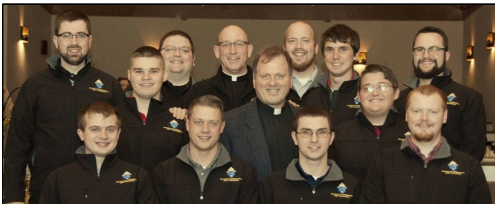
Pray for our seminarians! Pray for vocations!

July 2017: Not available at the time the bulletin went to press.