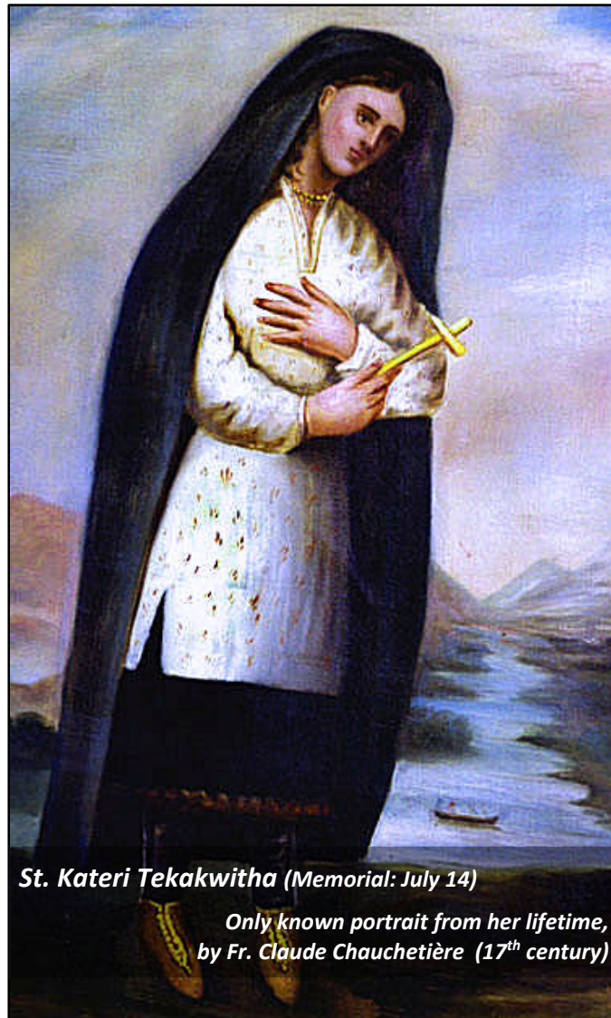
St. Kateri Tekakwitha (Memorial: July 14)